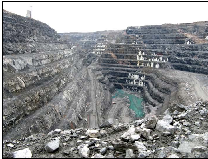
Looking south from the northern end of the north pit; note the pale pink, west-dipping pegmatite dykes in the western pit wall.

The mining process involves mining 15-m benches by drilling 8x9 m spacing and 17 m deep holes (away from pit walls), blasting, mucking, hauling with 172 and 218 t trucks, crushing in the pit followed by a conveyor to the ore stockpile. After the autogenous concentrator (where ore grinds itself along 5 grinding lines), milling, grinding, a 38-cell flotation removes pyrite and chalcopyrite, and chalcopyrite is separated out (0.03% Cu and >50% Au are lost with pyrite). The chalcopyrite concentrate undergoes thickening, dewatering, and drying, and then is stockpiled at an average grade of 28.5% Cu). Finally the copper concentrate is transported to Rönnskär smelter by train. Tailings are transported from the mill to the tailings pond along a 4.2 km pipe; water returns and is reused. The large waste dumps have been covered with several metres of soil, till, and fertiliser, and testing is ongoing to identify which grasses and trees will grow best on this surface. About 5000 million litres of water are pumped from the pit daily.