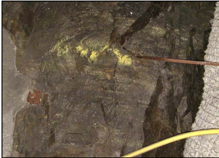
Decimetre-scale layering in sphalerite ore (6" bolt for scale); central zone, Stope 3.