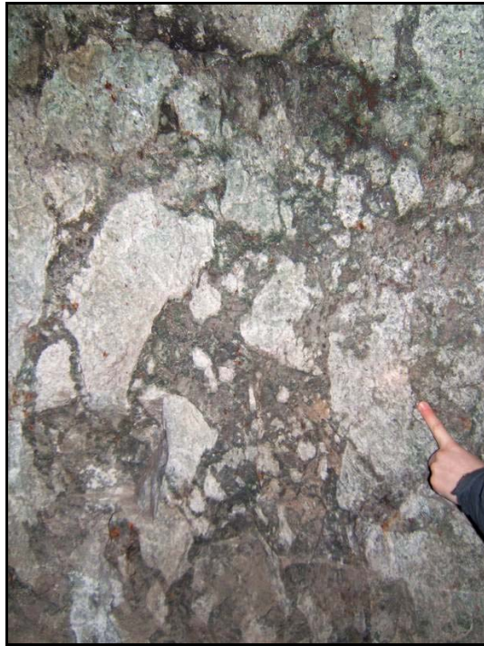
Dolomite marble breccias with serpentine matrix (indicator for nearby ore).