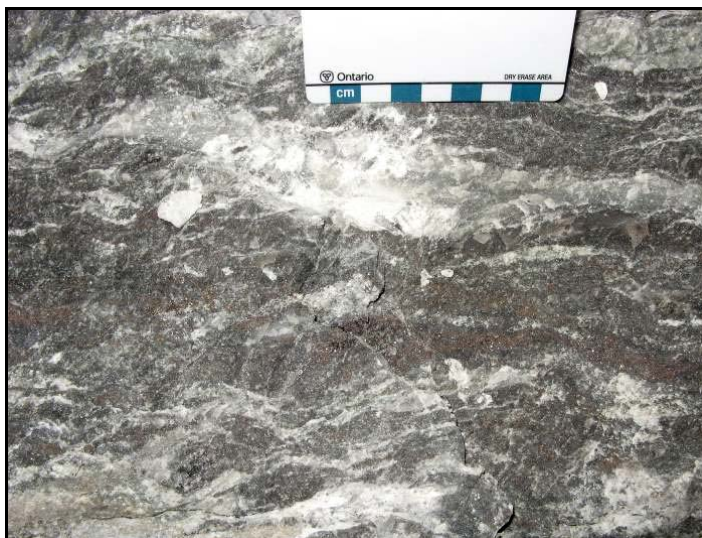
Fine-grained, disseminated, banded red-brown sphalerite horizons hosted in interbedded/interlayered siliceous marble and schistose metavolcanic rocks; Kyrken, 840-m level.