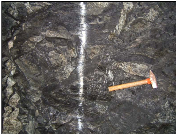
Low phosphorous B-ore (up to 80% Fe); note actinolite on fracture surfaces; Block 12, 716-m level.