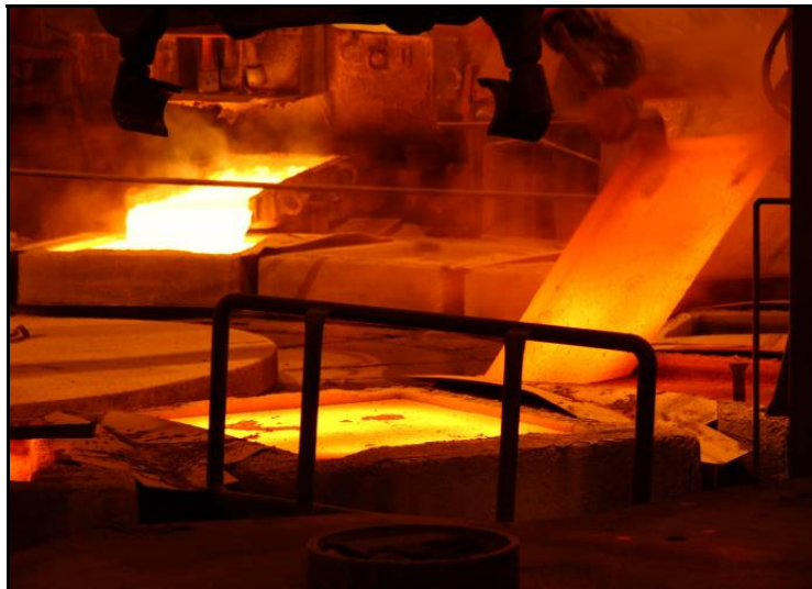
Pouring of molten, ~98% copper, water-cooling during rotation on a wheel, and removal of copper anodes for acid baths where copper moves into solution and precipitates at 99.998% Cu on steel plates.

Our tour was extensive and we were fortunate to witness almost every stage of the process. Watching from the control room, we were awed by the 50 t ladles that transferred the copper matte from the furnace to the converter and were even more impressed by watching the anodes being poured. Another interesting site was several enormous piles of electronic waste that the smelter also processes, an important source of income for times when metal prices are low and the source of most of the zinc clinker, and approximately a third of the gold, a quarter of the silver, and an eighth of the lead and copper products. It was a real highlight of the trip to see how the rocks we were seeing at the mines were processed, and how this can be done in an environmentally responsible manner.