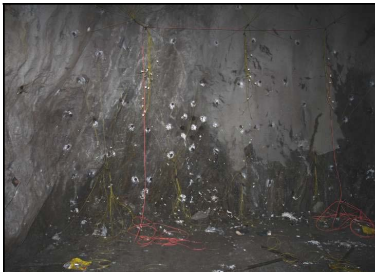
Medium-grained, banded pyrite and grey sphalerite ore in 0.5 million dollar round (grading 15-20% Zn); K-zone, 1100-m level.