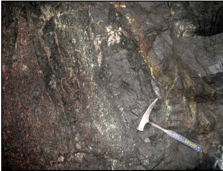
One-metre wide actinolite zone (left) at contact between B-ore (right) and barren country rocks (not shown); Block 12, 716-m level.