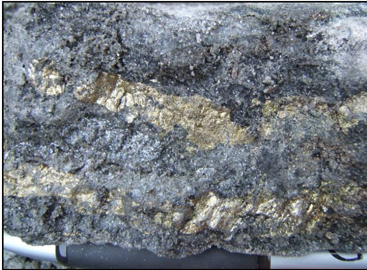
Chalcopyrite-pyrite-(pyrrhotite) quartz veins with chloritic selvages in garnetiferous muscovite>biotite schist (pen for scale); northwest wall, north pit.