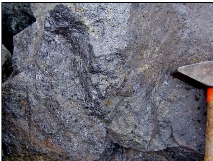
Massive, coarse-grained sphalerite (grey) ore; ore pile.