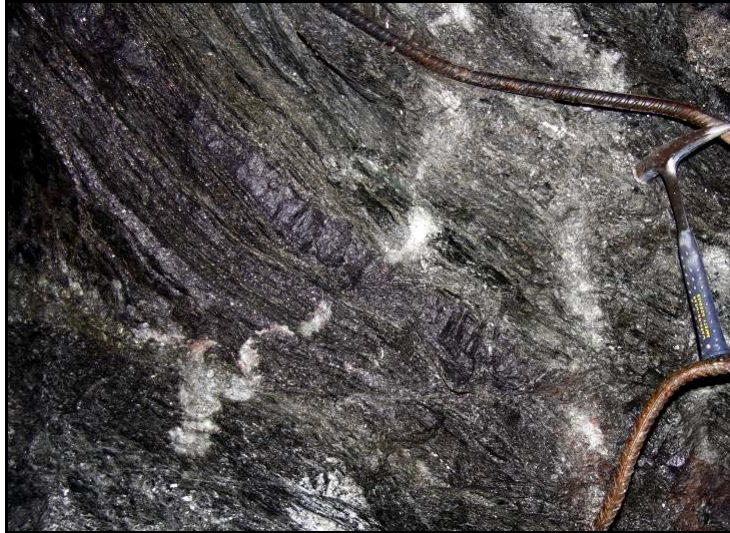
Steeply to moderately dipping, pyrite- and grey sphalerite-rich banding (up to 17% Zn) cut by quartz veins in pyritic (disseminated and coarse-grained or porphyroblastic) chlorite-sericite schist; K-Zone, 1100-m level.

allows for a total of about 2 rounds per stope each week based on 16-17 12-hour shifts a week. Interestingly, ore is transported out of the mine by 6 Volvo dump trucks, rather than the standard ore hauling trucks, and it was explained that these are less expensive for parts and faster at hauling. All ore is trucked 95 km to the Boliden mill although before 1991 the ore was transported by cable-car to the Boliden mill. At the mill, the ore is crushed and ground, then undergoes a flotation process that produces 3 zinc concentrates.