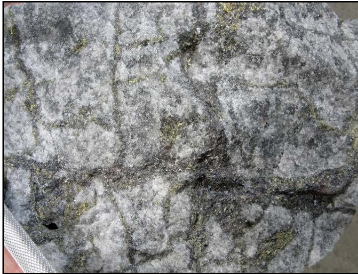
Sphalerite +/- chalcopyrite veinlet stockwork from the highly silicified feeder zone (8 m thick zone stratigraphically below the mineralisation; pen magnet for scale); ore pile.