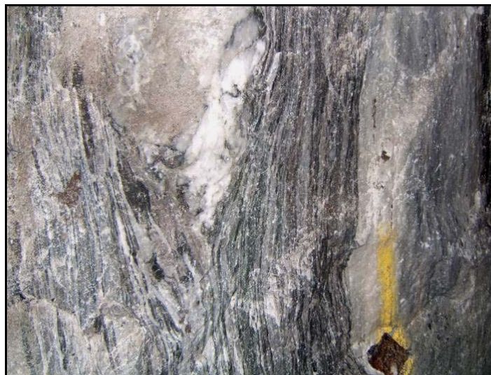
Host inter-bedded/layered marble and schist with boudinaged quartz veins adjacent to ore (bolt is 6"); Mechanical shop, 910-m level.