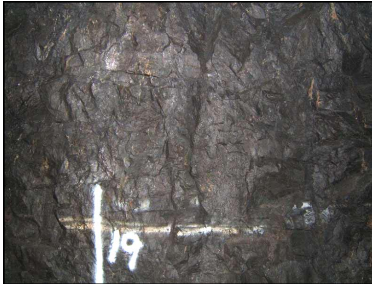
High phosphorous D-ore (6-7% P) with pale brown-cream sub-vertical “veinlets” of apatite and silvery hematite veinlets (image is ~2 m across); Block 12, 716-m level.

LKAB sells its iron ore as pellets, composed of about 70-80% iron and mixed with various additives (olivine, dolomite, etc.) specific to each customer's needs (product specifications are determined for individual customers in LKAB's own labs); the pellets produce about 85% less carbon dioxide emissions when roasted in furnaces and are one of the cleanest iron ores in the world. Concentration and pelletising of the high phosphorous ore is currently done at the mine but low phosphorous ore goes to Svappavaara for pelletising; however, there is a plan to develop a flotation system at Svappavaara whereby both ore types can go directly there for pelletising. Today, 12-16 trains transport ore to Narvik and about two trains travel to Luleå, daily.