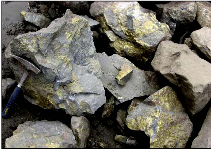
Coarse-grained, massive, high-grade chalcopyrite and sphalerite (grey) ore; ore pile.