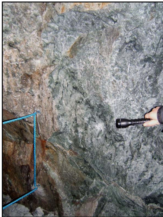
Sheared stromatolites defined by dark green serpentine horizons in dolomite marble; one of the few places these are preserved in Bergslagen.