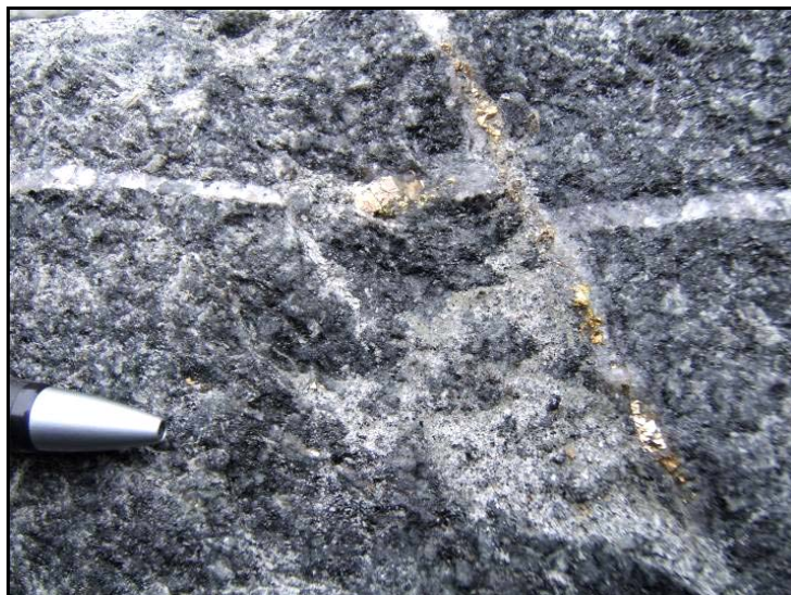
Chalcopyrite-pyrite quartz vein stockwork in quartz monzonite intrusion in footwall to orebody (~0.25% Cu); ramp along east wall, north pit.