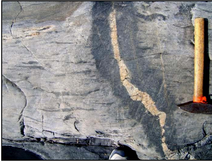
Quartz vein with dark selvage cutting thick volcanic bed with stringy dark fiamme (hammer handle points up).