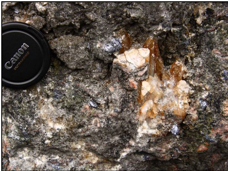
Coarse-grained plates of molybdenite associated with calcite in vug within a pegmatite dyke; northwest wall near bottom of north pit. These dykes are also known for vugs filled with well-preserved crystalline zeolite minerals.