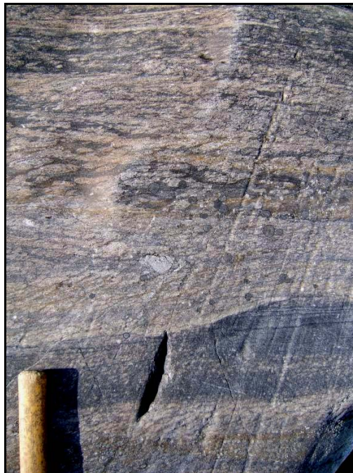
Intercalated siltstone-ash and lapilli ignimbrite turbidites with erosive base cutting laminated siltstone-ash; note realignment of relict lapilli to north (hammer handle points up).