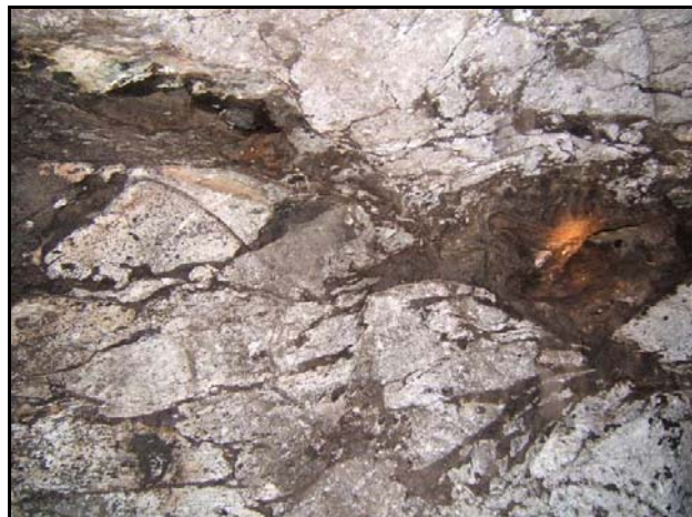
Anastomosing sphalerite-(galena) veins cutting dolomite marble in back/roof of drift.

The tour ended with a rest stop and chat in the heated banquet hall at the 160-m level, where several weddings feasts (and wedding nights in the adjacent bedroom!) have been held recently. Fortunately we did not encounter the “Lady of the Mine” who haunts Sala; all disturbances that could have summoned her (including whistling, swearing, and spitting) were carefully avoided by our group. Later that evening in the town of Falun, anyone with any energy remaining drove to the Falun mine site from our hostel and admired the orange-red open pit in the setting sun and spent an hour investigating the sulphide-rich rocks on the waste dumps until hunger forced us to find one of the many O’Leary’s pubs for food (popular amongst the Swedes, but for us a poor choice).